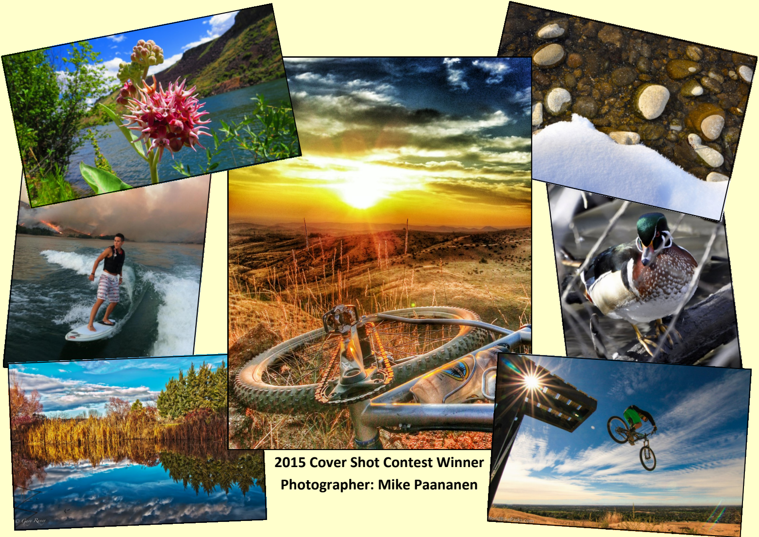
2015 Cover Shot Contest Winner

Photos must be submitted between October 1st - December 31st